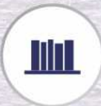
Book Store/ Library