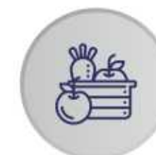
Fruit / Vegetable Store